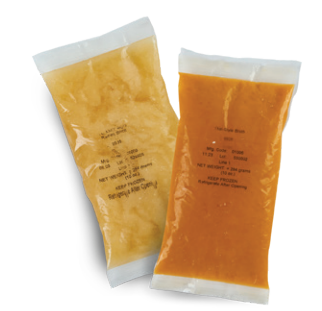
Custom Culinary<sup>®</sup> Gold Label Frozen Ready-To-Use Portion Pack Asian Broths