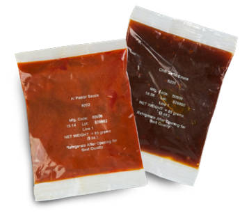
Custom Culinary® Gold Label Ambient Portion Pack Authentic Ethnic Sauces

From classic flavors to bold, on-trend varieties, our portion packs can be used across the menu—whether you offer meals that are ready to eat, ready to heat or ready to prepare at home. Try these versatile products back-of-house, holding on the line until use, or offer as a grab-and-go option.