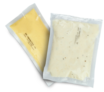
Custom Culinary® Gold Label Frozen Ready-To-Use Portion Pack Classic Sauces